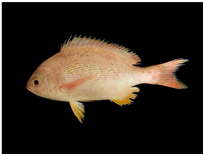
Figure 2. Pinjalo pinjalo 270 mm TL collected from the marine waters of Iraq.